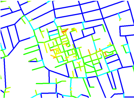
C Analysis of over-complex, under used spaces Post-war estates are typified by having overly-complex spatial layouts. This means that many spaces are under-used by everyday activity.