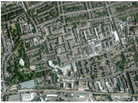
B Large post-war housing estate in Hackney