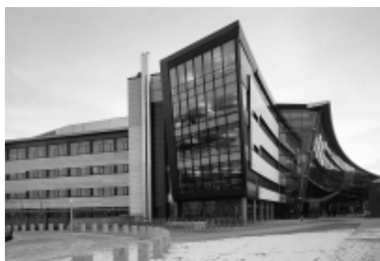
Figure 1a, b: Telenor Fornebu, overview, and perspective from East