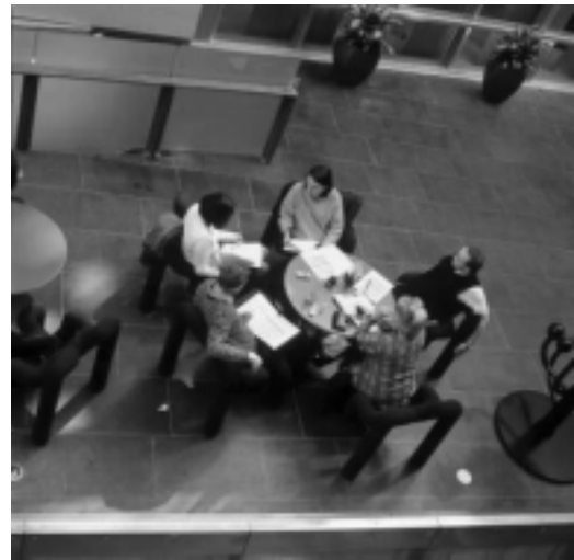
Figure 5: Lounge area for work and leisure.