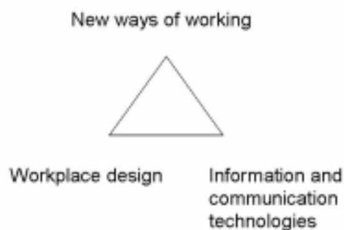
Figure 2: Conceptual model for the Telenor development project

At Fornebu one has abolished the idea that the individual workplaces should be customised or