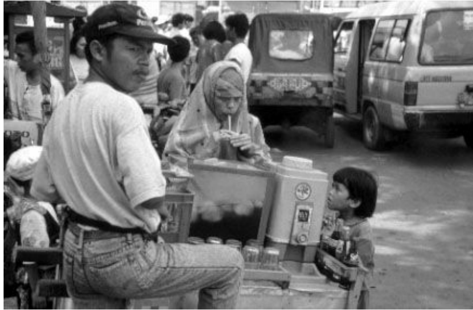
Figure 4: Second-level supergrid activity