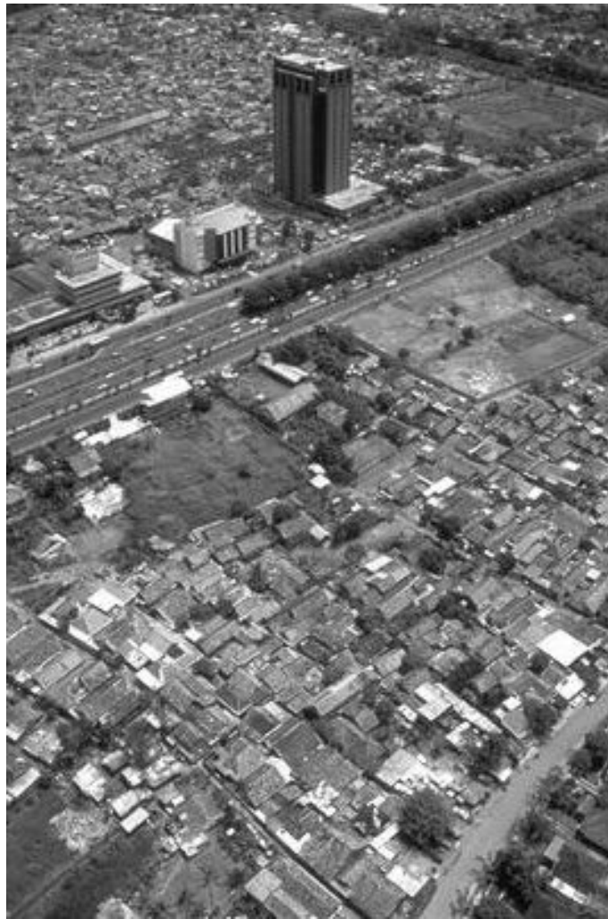
Figure 2: The first-level supergrid in the fabric

Meanwhile, the bulk of less formal economic activity and social interface, and there is an enormous amount of it, appears to be taking place in streets behind this 'first front'. In fact there is another level of supergrid operating in the interstices of the first level of supergrid, at a scale which is much closer to that of the typical supergrid pattern found in Amsterdam (Figure 3). It is here that Budiarto finds the spaces supporting the everyday social and economic lives of the majority of the city's inhabitants. These spaces connect, as he shows, local with wider city scales in ways which produce particular conditions which are supportive of particular local economies. They produce places also, related to regions at local and wider city scales, which reflect the spatial strategies of their populations. Budiarto considers three different types of informal settlement or 'kampung', with their different characteristic economies, and shows how each produce different place conditions, based in different relations between the local and the wider scales.