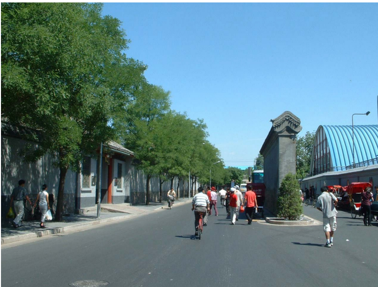
Figure 3: Photo shows “local street”

The notion of supportive spatial environments can be elaborated in various ways. Here we are going to ask two basic questions: 1, what aspects of the social network are being supported by the local spatial network? And 2. by what spatial features are they being supported (what are the mechanisms involved in the process)?