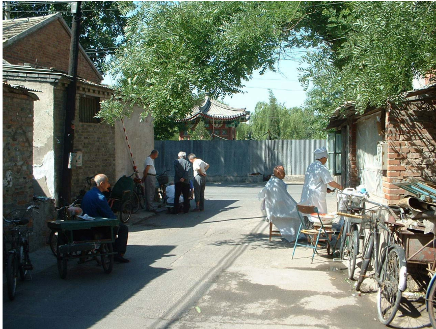
Figure 4: Photo shows “Hutong”**

** Hutong: A hutong is an ancient city alley or lane typical in Beijing, where hutongs run into the several thousand. Surrounding the Forbidden City, many were built during the Yuan (1206-1341), Ming (1368-1628) and Qing (1644-1908) dynasties. The main buildings in the hutong were almost all quadrangles--a building complex formed by four houses around a quadrangular courtyard. The quadrangles varied in size and design according to the social status of the residents. hutongs are passageways formed by many closely arranged quadrangles of different sizes. The specially built quadrangles all face the south for better lighting; as a result, a lot of hutongs run from east to west. Between the big hutongs many small ones went north and south for convenient passage.